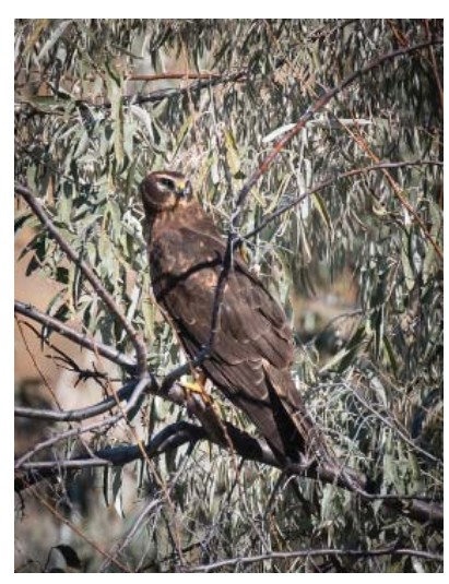
Female Northern Harrier