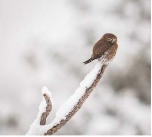
Northern Pygmy Owl