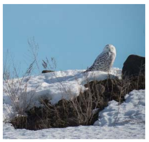
Snowy Owl

Did anyone, besides me, get excited with last week's (mid-February) extraordinarily warm temperatures? I was outside everyday looking for a Say's Phoebe or Mountain Bluebird and thinking about spring wildflowers despite still having nearly a foot of snow on the ground. Last weekend (Presidents' Day) changed all that with new snow and harsh winds and temperatures plummeting below zero. And then a nasty sinus cold only served to make things worse. This too shall pass, and I will feel well again, and spring will come.