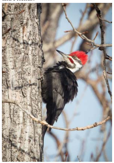
Pileated Woodpecker

boarding and kayaking all weekend long. How do you finish a perfect day? By attending the evening Song Bird concert and listening to the amazing world-class sounds of the Marlin Handbell Ringers and Friends!