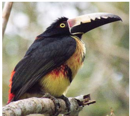
Collared Aracari by Karen Mulcahy, Winthrop

But what birds we saw! Our Winthrop group decided we had to see a Jabiru, and an Ocellated Turkey and for me, any Trogan would do. Alas, our guides were very wary about our seeing any Jabirus (too much water everywhere for them to be congregated in the lagoon area of Crooked Tree). But there we were on our way to our snorkeling adventure the last full day at Crooked Tree, and one lone Jabiru flew overhead as we were getting ready to leave. The locals helped us find