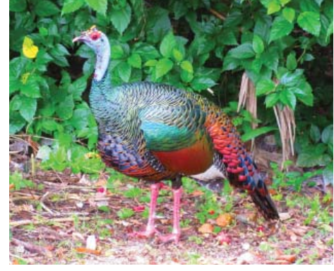
Ocellated Turkey in Guatemela

was able to contact someone who said they would take care of that. I tried it and got a similar response. She said," I have coded your account and limited the amount of renewal notices you are receiving to once a year, right before the time of expiration." Hopefully this will work. If you are tired of excessive junk mail from NAS, try this site http://www.audubon.org/contact-us and hopefully they will begin to get the message that members are tired of their mailings.