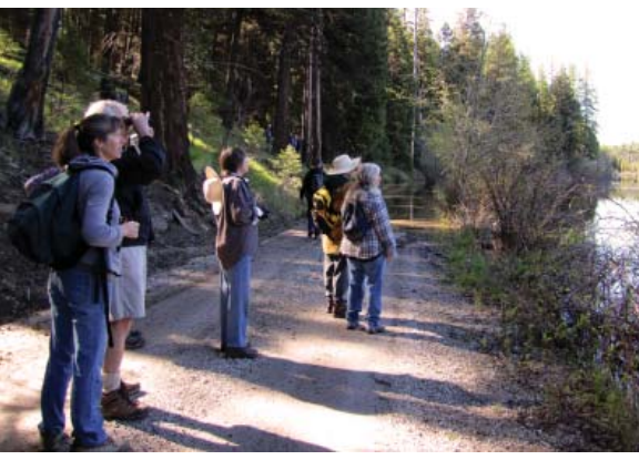
Birders at Lost Lake

OHA is teaming up with the Okanogan Land Trust (OLT) to offer an educational birding field trip in the Okanogan Highlands on June 17. The event will begin at a private landowner's property in Wauconda and then move to Lost Lake for a finger food potluck picnic, followed by an afternoon birding hike through OHA's Lost Lake Wetland and Wildlife Preserve. Priority registration will be given to current OHA