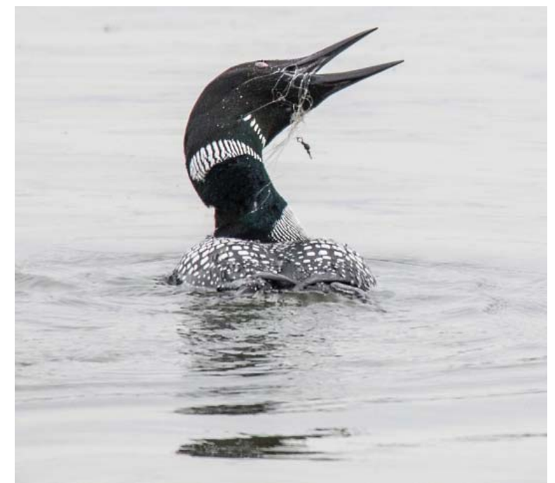
Common Loon tangled in fishing tackle

We are finally seeing a bit of warm weather this week. The thermometer may have hit 60 today. Compared to last year, it seems like everything is two weeks behind. However, the birds arrived on time and I wonder how they are faring. Nights have been frosty and the hummingbirds are anxious to eat from the feeders at first light and into the evening. Are there enough bugs for all the fly-catching birds? The swallows are moving into nest boxes. Osprey are carrying sticks to nests on snags and platforms. Great-horned Owls and Common Ravens are already raising young. Nature keeps moving forward with great optimism.