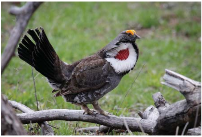
Dusky Grouse displaying to attract a mate

This time of year, each day is full of anticipation of new birds arriving from the south or new wildflowers on our hill or the scent of cottonwoods ready to unfurl. It is lovely to once again see the hills covered with a bright green velvet and soon they will be covered with the yellow of arrowleaf balsamroot too!