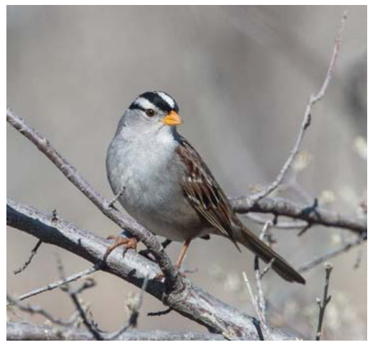
White-crowned Sparrow

May 9, 8:00-10:00 am, Bird Walk May 14, 5:00-7:00 pm, Flower Walk May 24, 5:00-7:00 pm, Flower Walk May 29, 7:00-9:00 am, Bird Walk