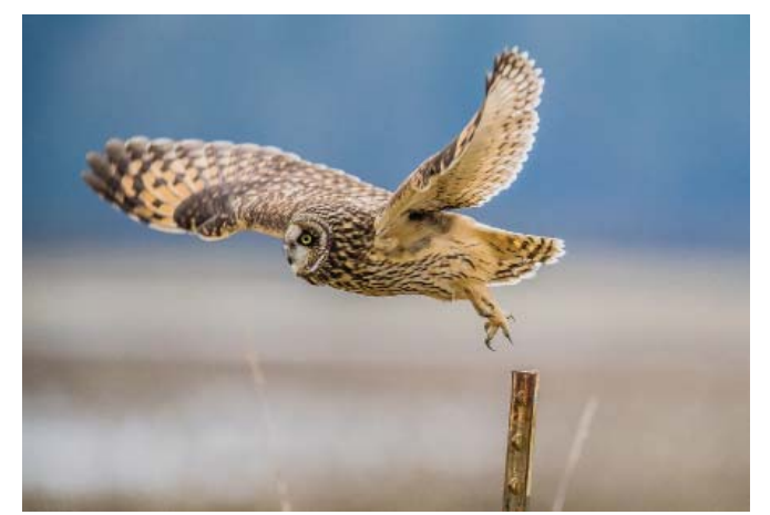
Adult Enthusiast First Place Short-eared Owl by Ken Longley