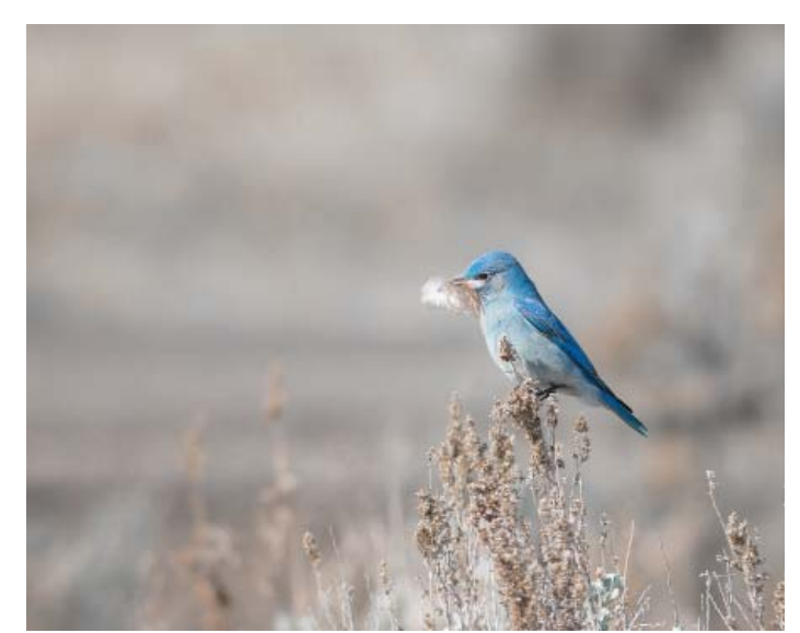
Mountain Bluebird Adult Enthusiast Honorable Mention NCW Audubon 2018 Photo Contest

The weather was good and within a few hours 51 existing songbird boxes along Bear Creek, Gunn Ranch, and Rendezvous roads had been cleaned out or replaced, and eighteen new songbird and three new kestrel/owl boxes had been installed on the Cottonwood property between Winthrop and Twisp. Mary reported all the songbird boxes along Gunn Ranch and Rendezvous roads were completely filled with House Wren sticks and had been useless nest sites for many