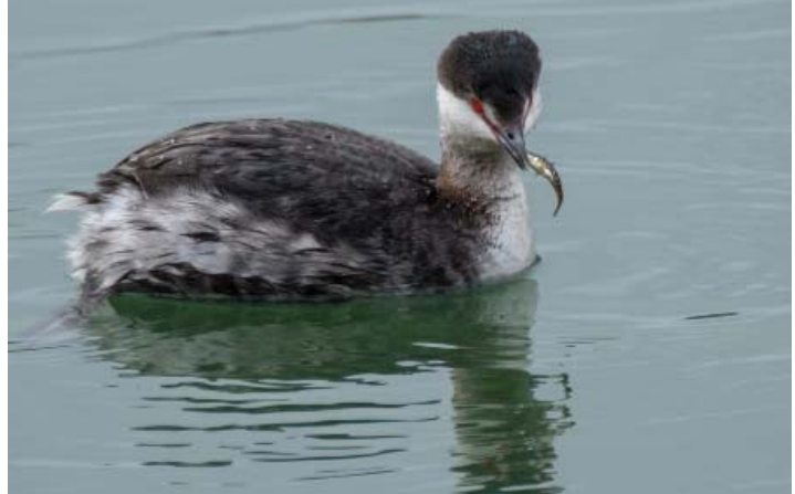
Horned Grebe fishing on the Columbia near Pateros

Meanwhile, the volunteers at North Central Washington Audubon Society would like to extend a sincere apology for the mess up in last month's Wild Phlox printing. The printer printed the March issue (again) instead of the April issue and the volunteer printing crew went through all the work to get it ready to mail and sent out the March issue for the second