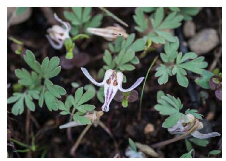
Steershead, Dicentra uniflora photo by Teri J Pieper, Methow Valley