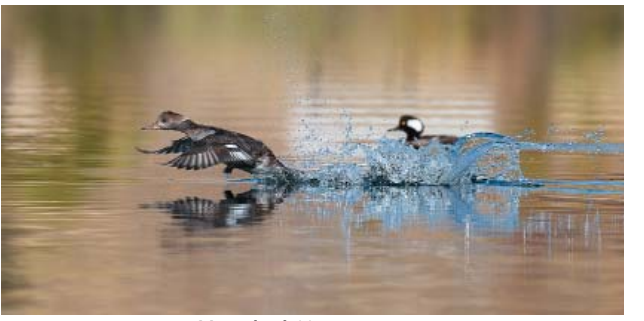
Hooded Mergansers

For the past 45 years, Hitchcock and Cronquist's one-volume Flora of the Pacific Northwest has been the most widely used field manual for identifying the vascular plants of our region. The innovative design of detailed keys supported by extensive illustrations set the standard for how to produce a regional flora. However, advances in plant taxonomy, nomenclatural changes, the discovery of undescribed species, and the documentation of native and introduced species not previously known from our area have all contributed to "Hitchcock" being of limited use for botanists today. The talk will cover the origins of the first "Hitchcock", an overview of project operations, and highlight some of the significant changes contained in Flora of the Pacific Northwest, 2nd edition .