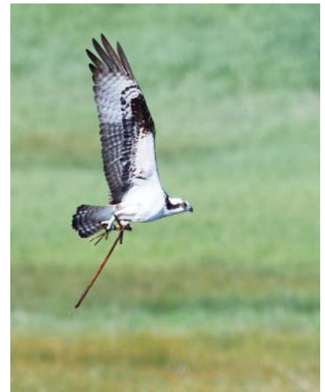
Osprey with appropriate nesting material - a stick

Recently a series of photos went around showing an Osprey with baling twine tangled around its leg while it was still in its nest near Winthrop. It appeared that the bird never was able to fly out of the nest and it may have died up there. The local electric utility sent over a boom truck to attempt to free it, but the nest was just too high. Everyone who witnessed this was deeply saddened. Last year, the Okanogan County Conservation District began to try to educate people about the dangers of baling twine to nesting birds, in particular Ospreys. At https://hs.umt.edu/osprey/documents/balingtwine.pdf there is a brochure that illustrates the danger and suggests what to do with used twine. This is the second year in a row this has happened around here and I think it's time we came up with some way to address the issue of discarded baling twine and how to dispose of it properly or recycle or repurpose it.