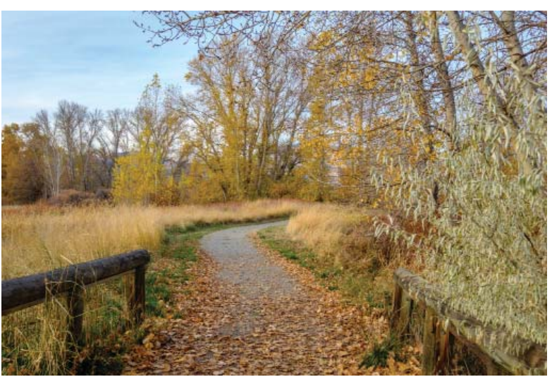
Horan Natural Area

Audubon Washington's Christi Norman talk will focus on the 2018 accomplishments of the Sagebrush Songbird Survey. The survey is a partnership between Audubon WA and Washington Department of Fish and Wildlife as a a collaborative, community-based science research program. The goal is to improve knowledge of Columbia Plateau shrub-steppe bird distribution, and to test and improve accuracy of scientific sagebrush obligate songbird species distribution models. Now in its sixth year, over 200 volunteers have collected field data and posted it